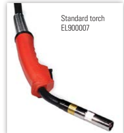
Standard torch EL900007