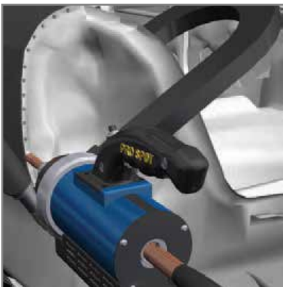
300mm & 600mm optional arms available to weld in hard to reach areas.