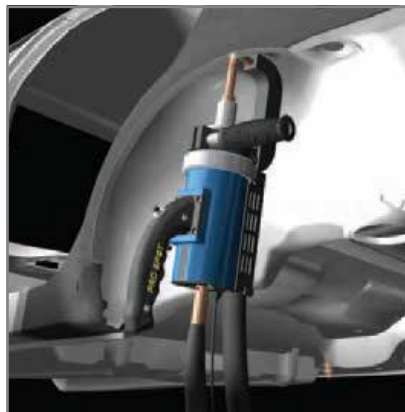
Wheelhouse arm applies consistent welds in difficult areas like the wheelhouse.