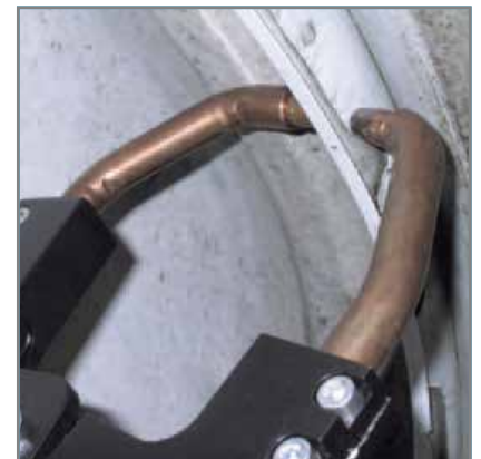
C-X adapter option can be used in applications where a C-type arm cannot reach.