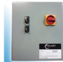
UL & ETL listed control panel