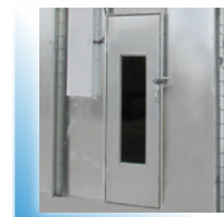
Windowed personnel access doors