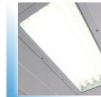
Industry-leading light levels