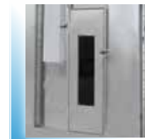
Windowed personnel access doors