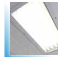
Industry-leading light levels