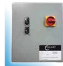
UL & ETL listed control panel